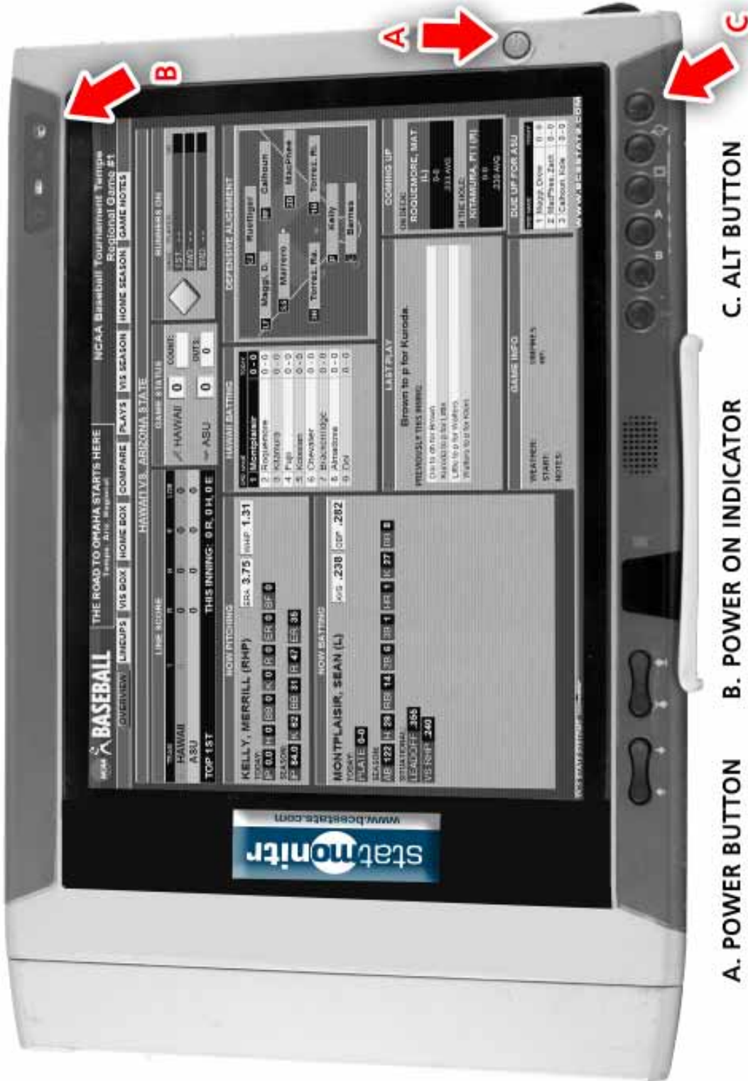
A. POWER BUTTON B. POWER ON INDICATOR C. ALT BUTTON